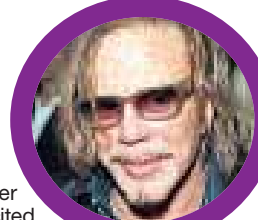
Main man... Mickey Rourke